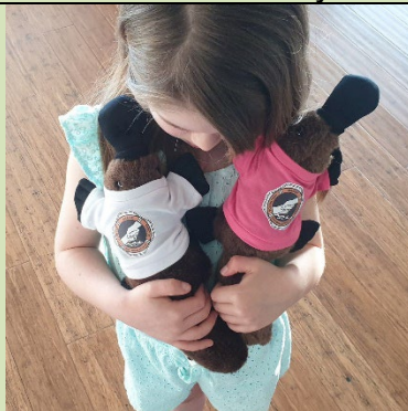
Platypus Soft Toy