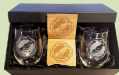
Stemless Wine Glasses with Timber Coasters Gift Set