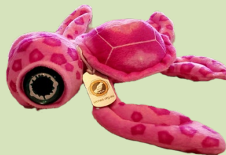
VMRWA Turtle Soft Toy - Pink