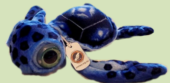
MRWA Turtle Soft Toy – Blue