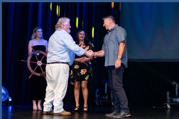
VMRWA Commander's Award Marine Rescue Jurien Bay