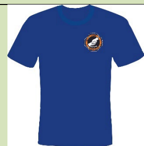
Blue Cotton Short Sleeved Tee Shirt