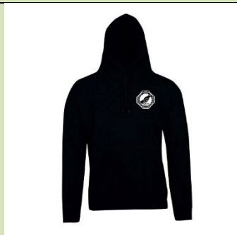
VMRWA Hoodies: Black