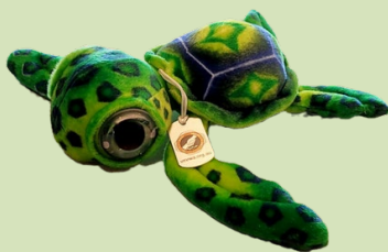
VMRWA Turtle Soft Toy - Green

VMRWA Merchandise — Available at the online shop: https://www.vmrwa.org.au/shop