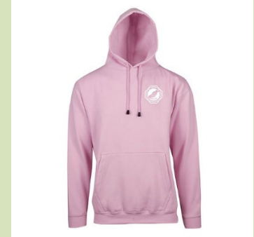
VMRWA Hoodies: Pink