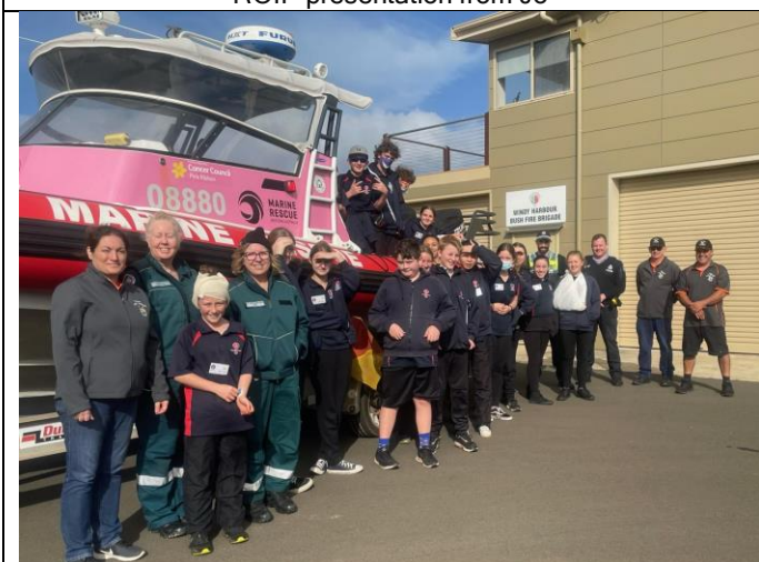
Winy Harbour and the pink RV