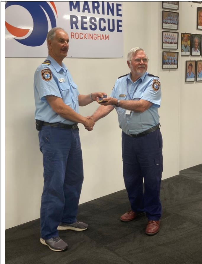
Rockingham presentation - thanks for the invite