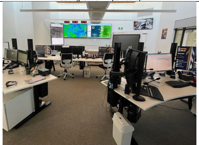
Fremantle Water Police - Incident Control Centre