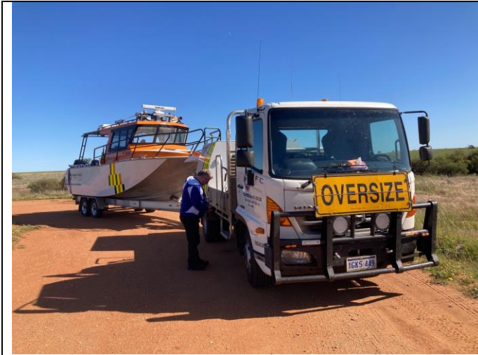
Port Walcott's RV going home - driver change