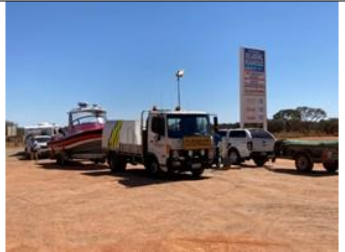
This is why we try to avoid school holidays on the road