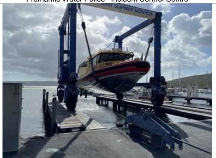
The "Starship Esperance" getting a tidy up